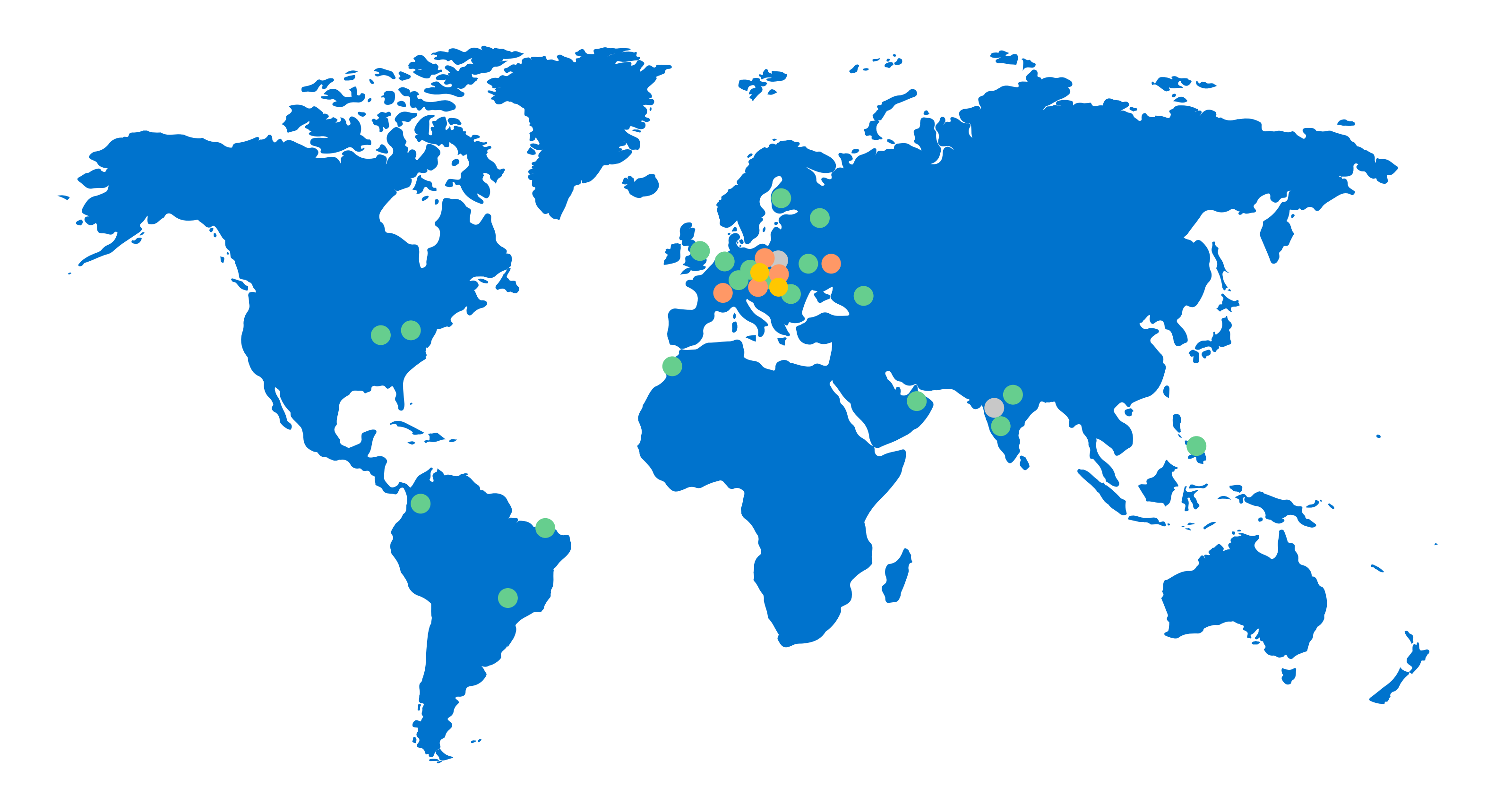
THANKS TO THE ENGAGEMENT OF BOTH CANPACK AND OUR EMPLOYEES

IN 2021 WE SUPPORTED OVER 140 EXTRAORDINARY CAUSES ALL OVER THE WORLD